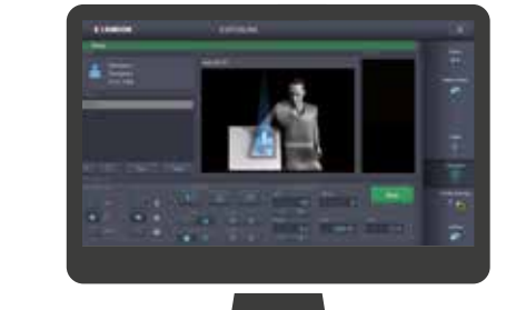
EXAMION X-AQS Acquisition Console